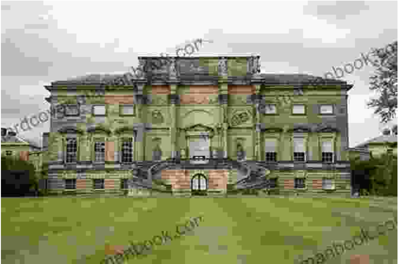
Thomas Rayne, Kedleston Hall, Derbyshire, England, 1760s

features a symmetrical facade, Ionic columns, and a magnificent central hall.