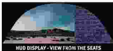
HUD DISPLAY - VIEW FROM THE SEATS